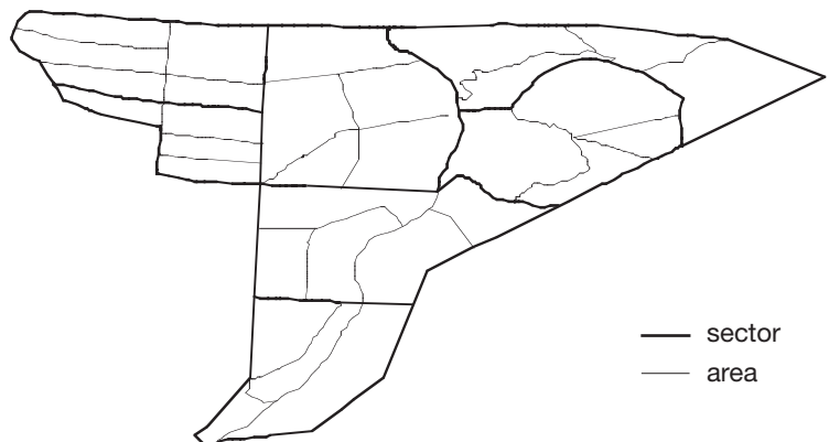
Figure 1. Solio Game Reserve showing partitioning into sectors and areas.

The 68-km 2 reserve was mapped using a Garmin 12 hand-held GPS set with freely available TrackMaker software enabling the transfer of data to computer. Features included the reserve fence, all main roads and usable side roads, bridges, rivers, dry riverbeds, water points such as dams and water troughs, and all entrance gates. The map was partitioned into smaller sections and areas (fig. 1) based on established roadways or natural features such as riverbeds. For security purposes, there were seven sectors with the objective of staffing each with a resident basic three-man patrol. For monitoring purposes, each sector was divided into four or five areas, and further by habitat type into bush or plain. All the data were loaded into ArcView GIS and used to draw sector maps and determine their size, the size of each area, and the proportion of bush and plain in each sector and area.