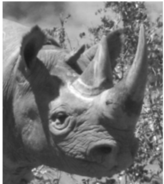
Figure 4. Karanja, probably one of the oldest male rhinos in the world.

daytime location. All these factors suggest that single precise GPS location fixes are heavily biased to time-related sightings and do not represent the full range the rhino uses. According to Tatman et al. (2000), the range should be estimated using additional data from